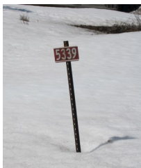
Old style! This needs to be REPLACED!!!!

If you are unsure if your fire number is up to date, all it takes is a simple call to the Clerk's office to check: 218-525-5705