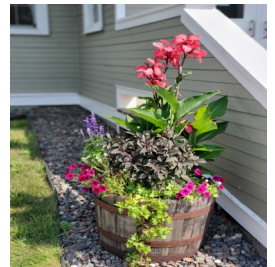
Flower Pot at Town Hall