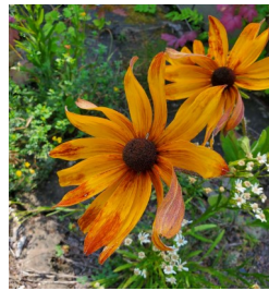
Flowers at the Town Hall