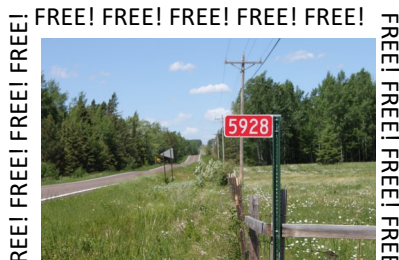
FREE AND NEW! JUST CALL!!