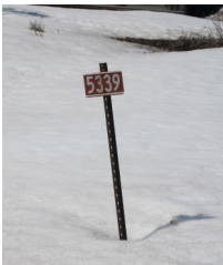
Old style! This needs to be REPLACED!!!!

If you are unsure if your fire number is up to date, all it takes is a simple call to the Clerk's office to check: 218-525-5705