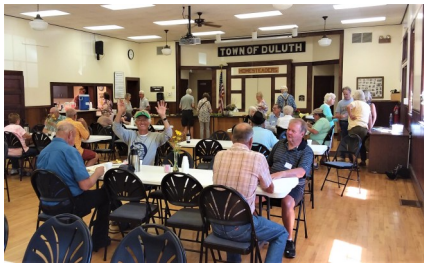
Come on Home Party 2021